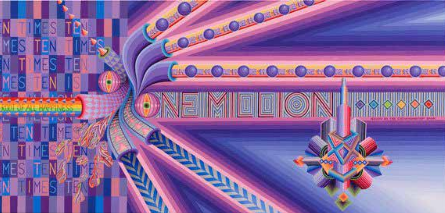
"one million" note