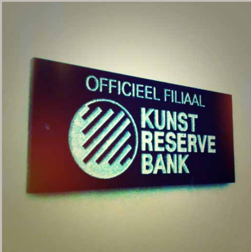
Art Reserve Bank Berlin branch