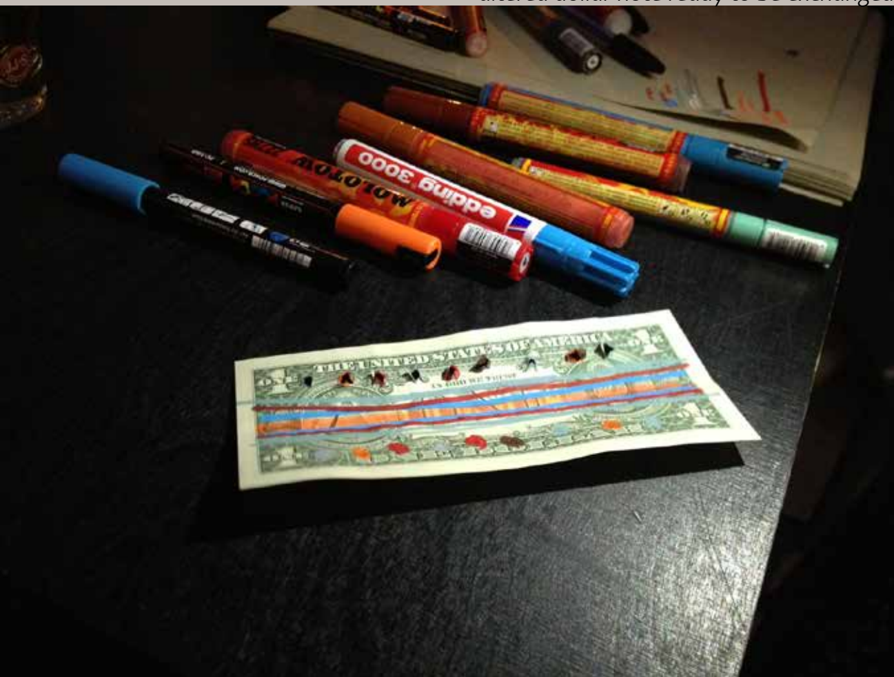
altered dollar note ready to be exchanged