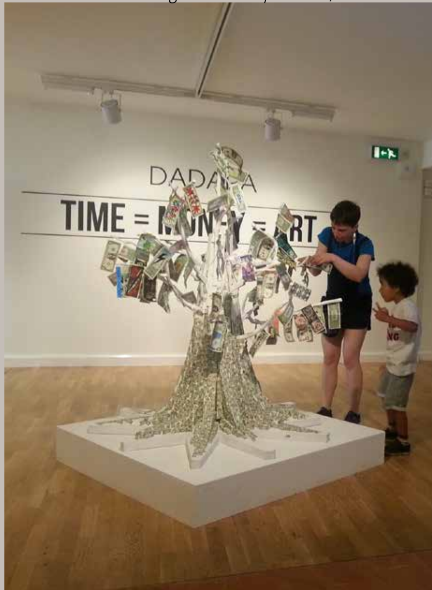
Birmingham Centre for Music, Arts & Culture