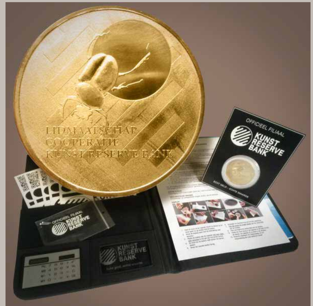
kit for branch managers