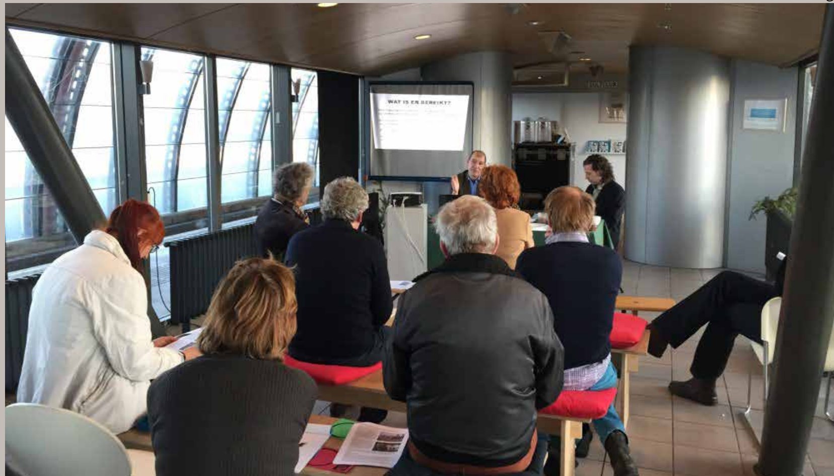
Art Reserve Bank 2014 board meeting

Besides investing in a work of art, anybody who buys a coin becomes a voting member of the cooperative bank and can decide its financial and artistic future at the yearly board meetings.