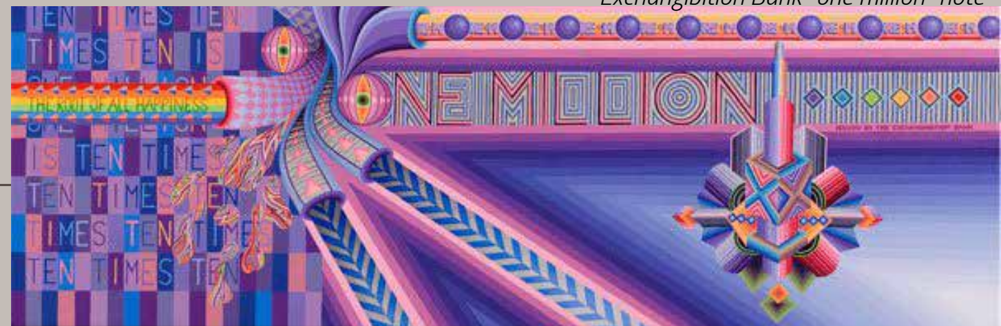
Exchangibition Bank "one million" note