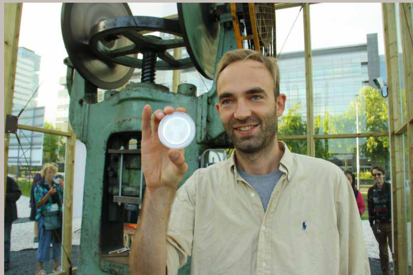
artist with a freshly minted coin