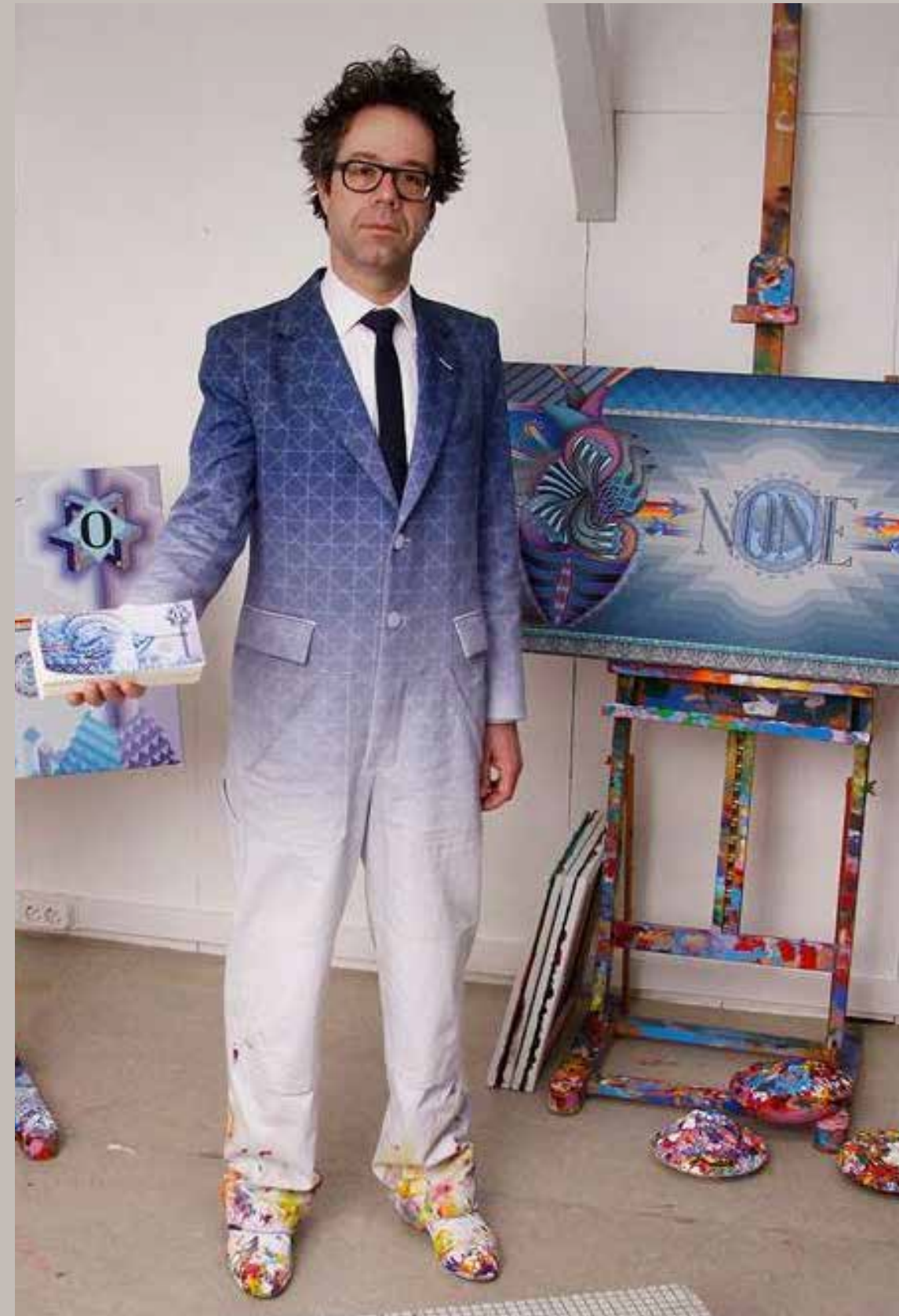
the artist with the "zero" note, front and back