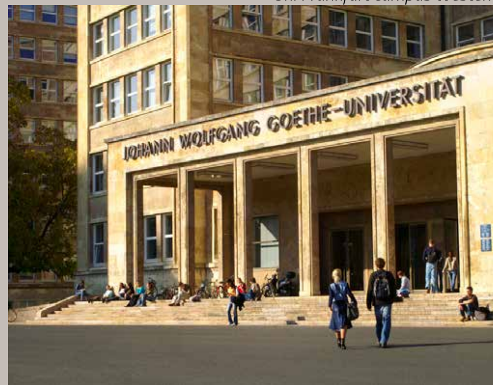
Uni Frankfurt campus Westend