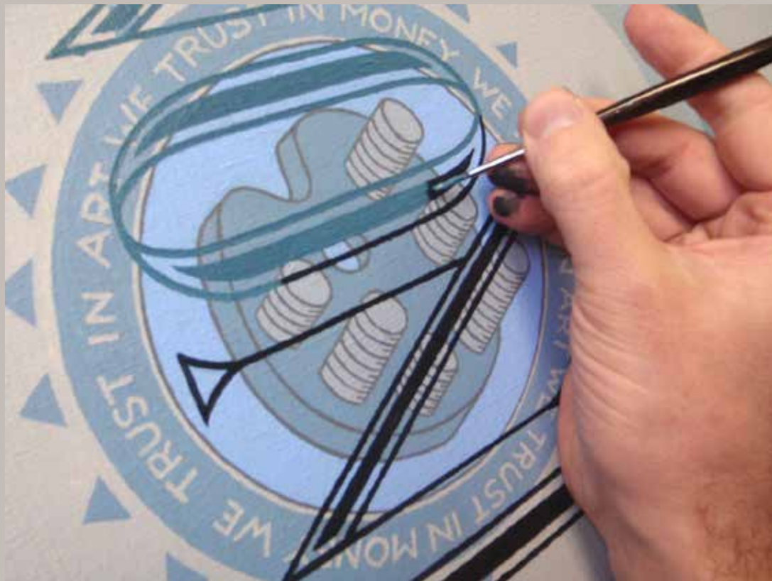
painting of the "zero" note