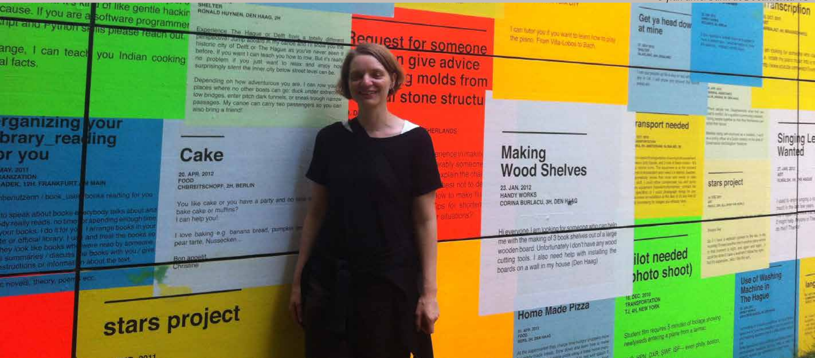
e-flux time/bank at Documenta 13