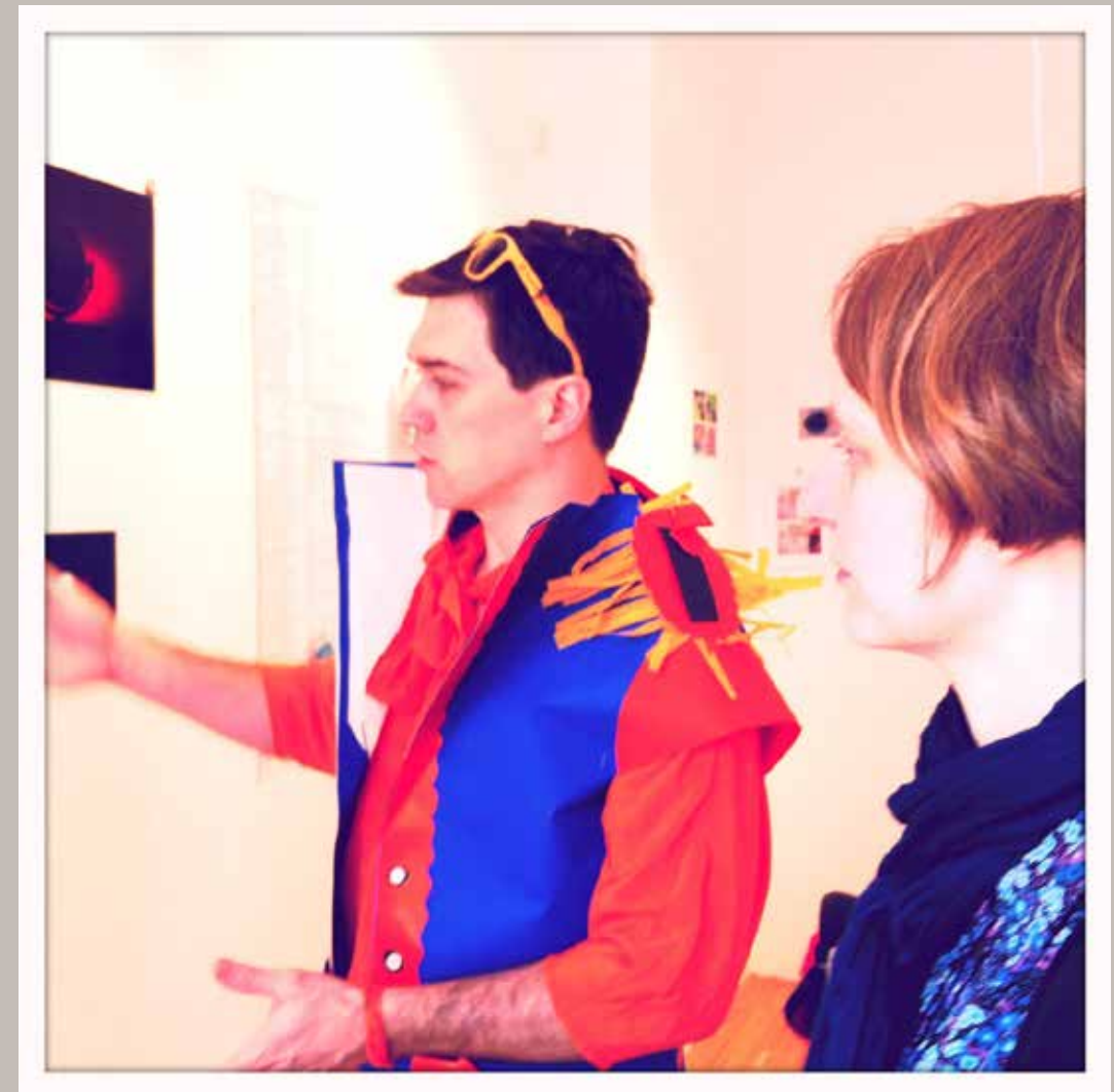
both parties of the exchange