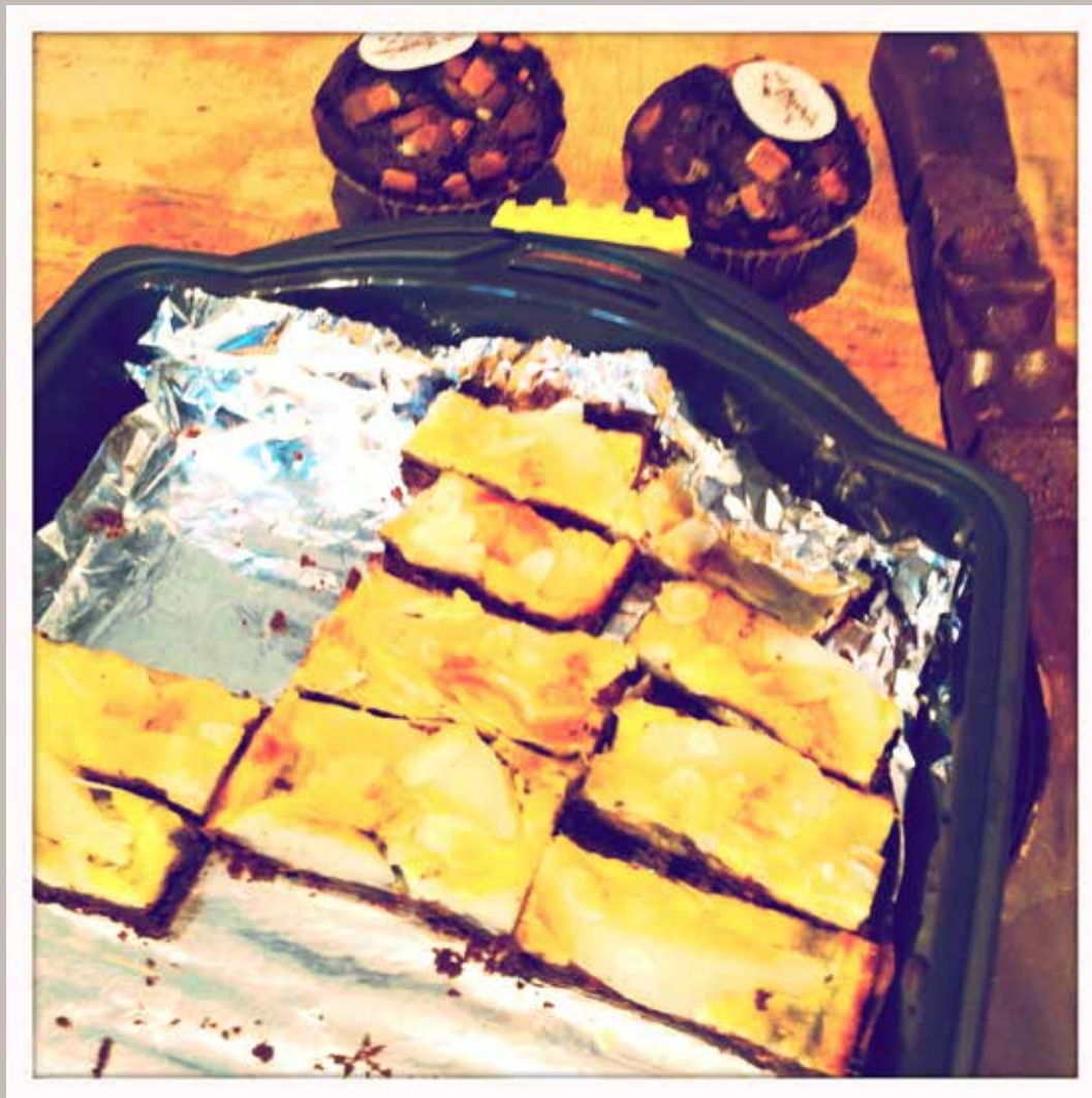
cake exchanged for time/bank hours