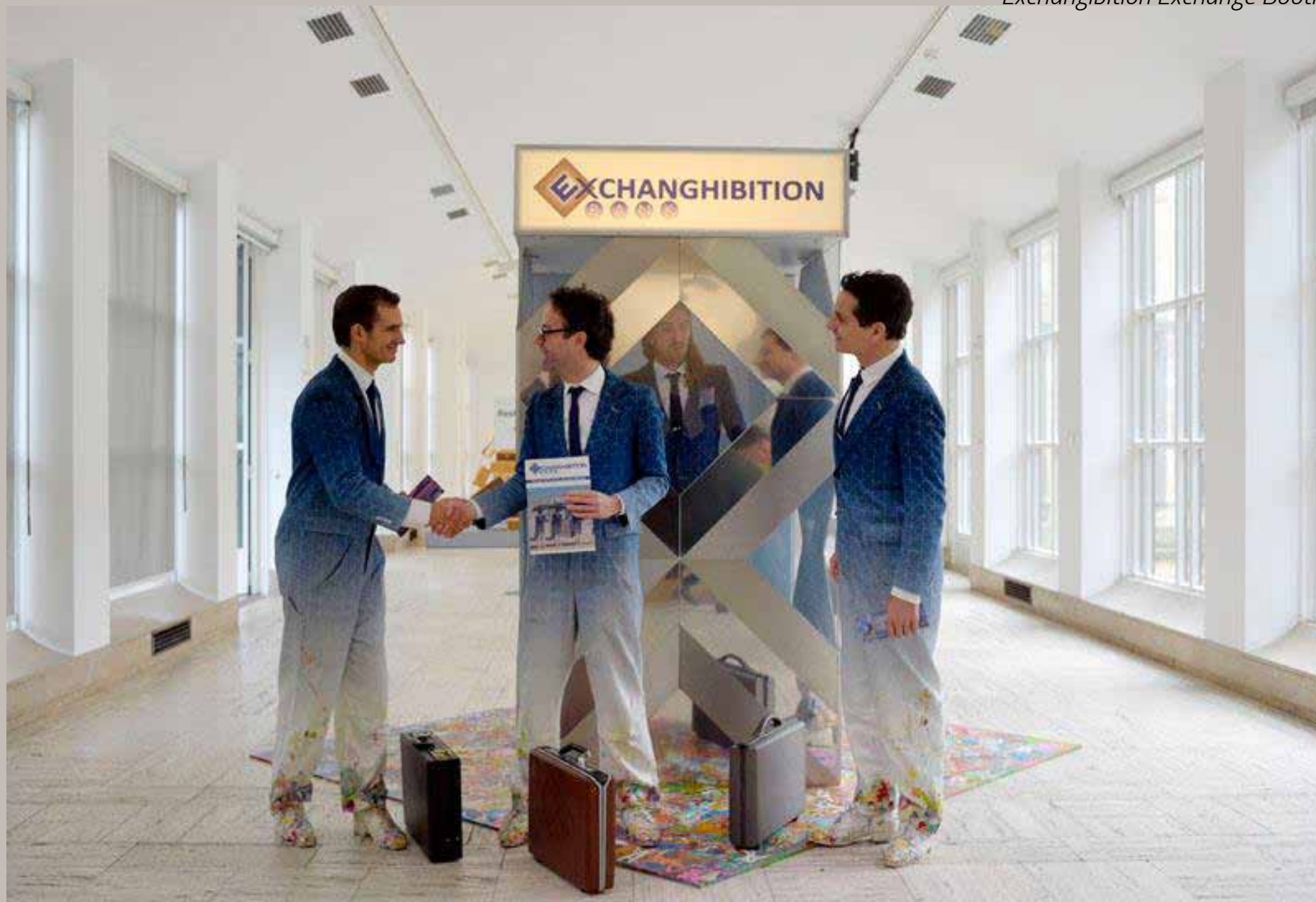
Exchangibition Exchange Booth