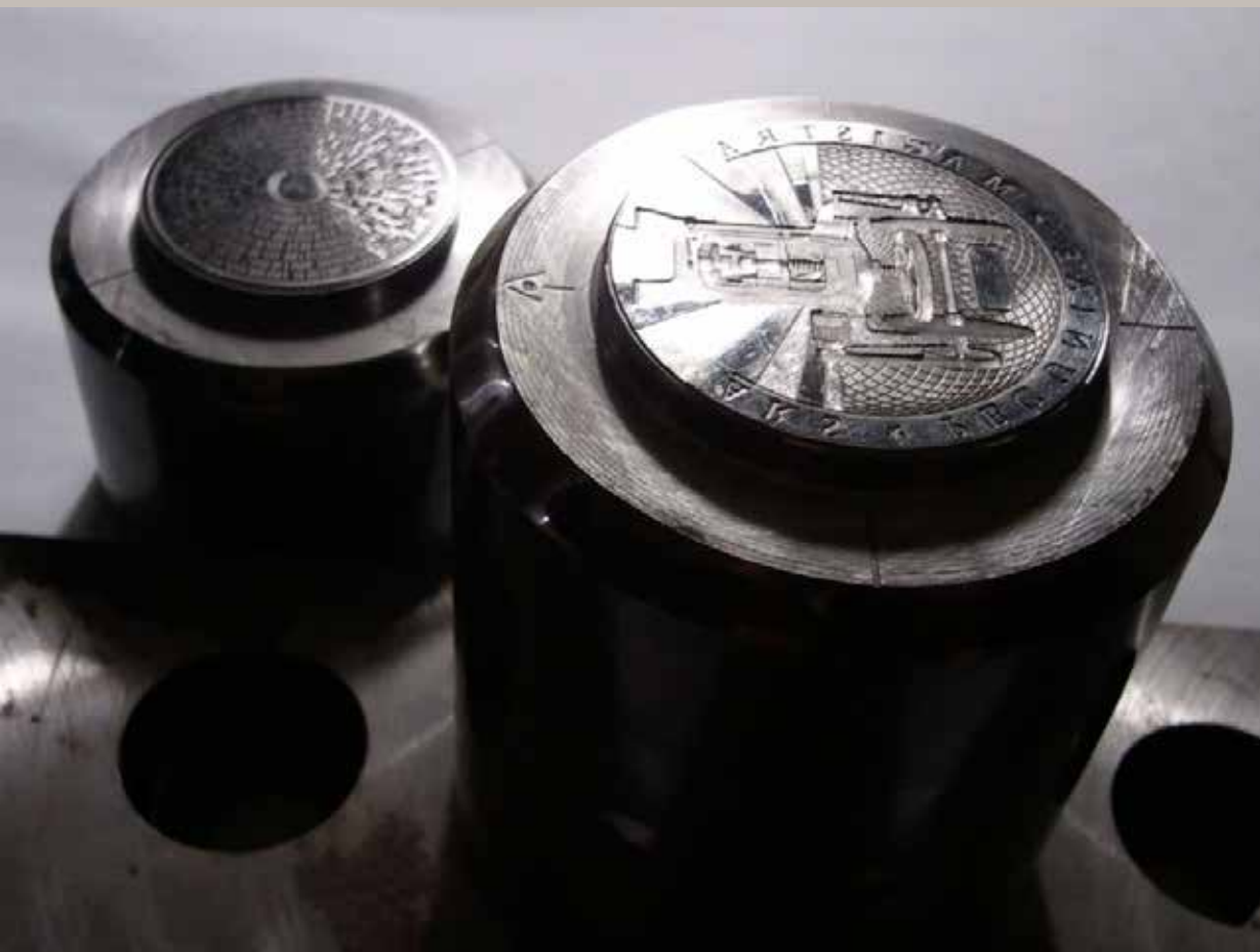
stamps for both sides of the coin

There is of course always a risk of a “bank run”, in which case the experiment will end. It's unlikely that the Dutch government will be willing to bail the bank out with public funds.