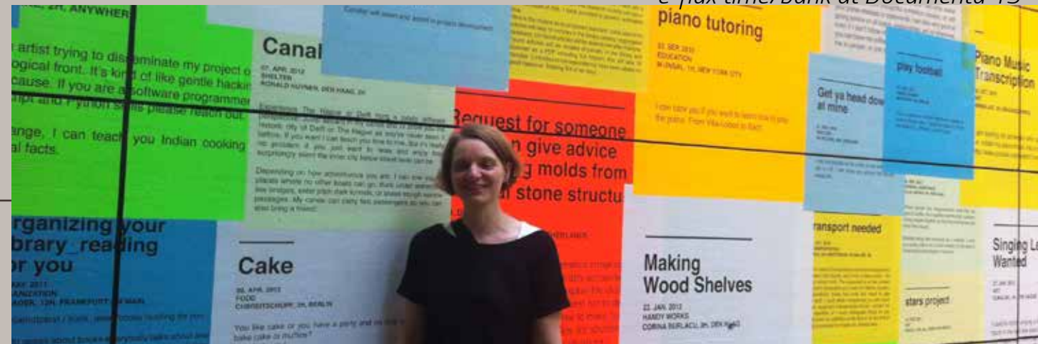
e-flux time/bank at Documenta 13