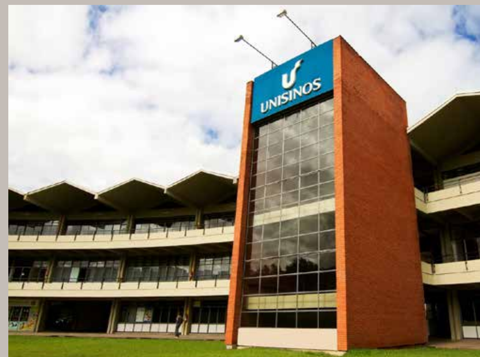
UNISINOS campus Sao Leopoldo